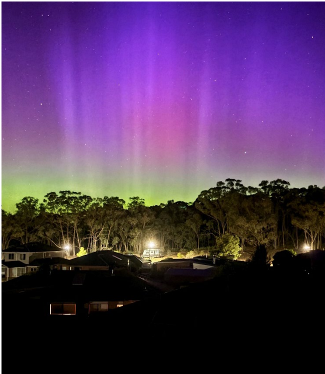
Aurora over Castlemaine

The Aurora was caused by a Coronal Mass Ejection from the Sun sending out charged particles that get trapped in our atmosphere around the poles. The charged particles interact with gaseous molecules in our atmosphere and produce light rays of different colours.