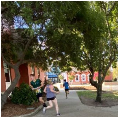
Assumption College, Kilmore