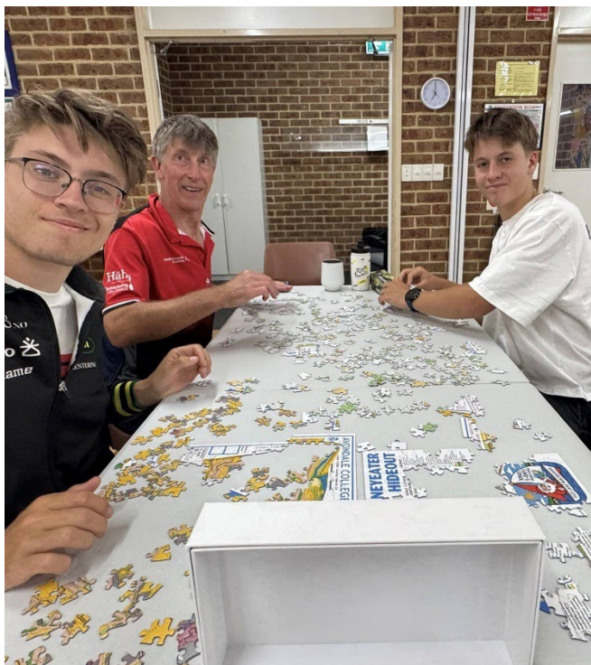
O Jigsaw night at Xmas 5 days

Many people stayed in nearby accommodation, but the organisers arranged some low-cost camping on a beautiful property owned by a Newcastle club member.