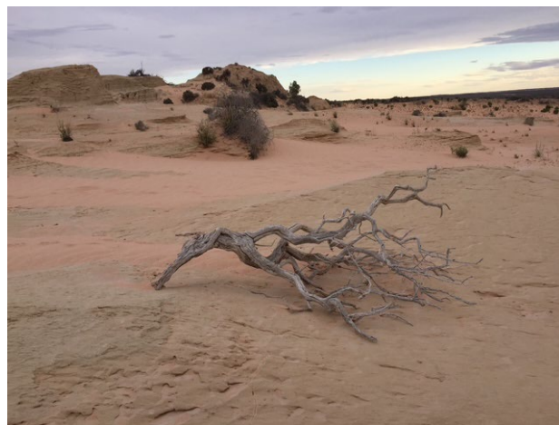
Mungo National Park

However, the National Park has a first-class Visitor Centre where the anthropological significance of the 40,000 years old remains of what is known of 'Mungo Lady' and 'Mungo Man' is well told. The striking sand dune scenery speaks for itself and guided walks are available for those that leave their vehicle.