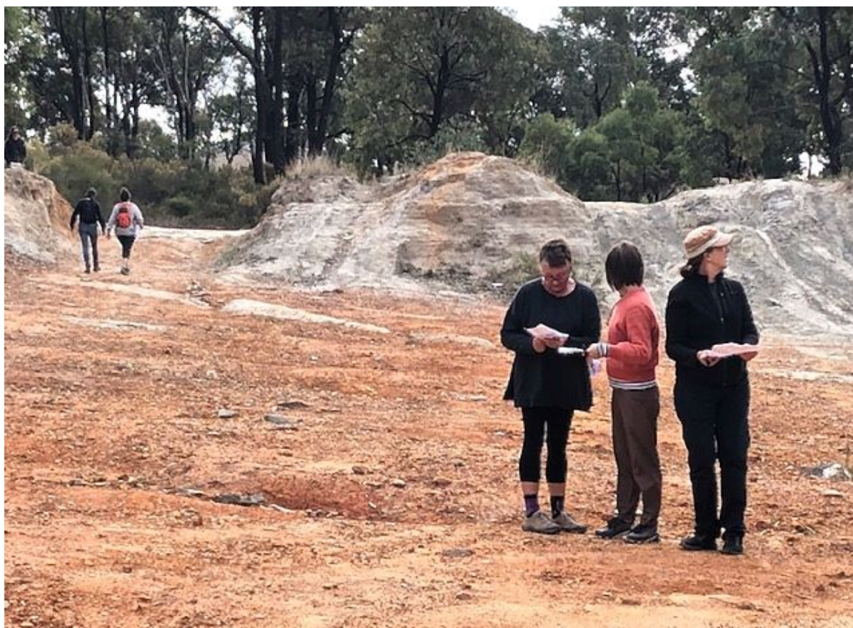
Which way will we go ??