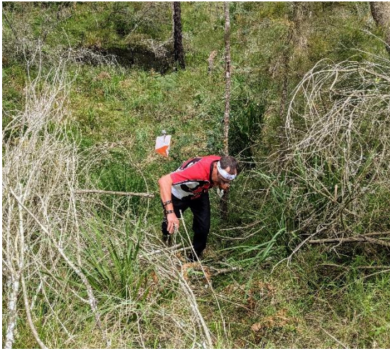
Broulee Dunes vegetation