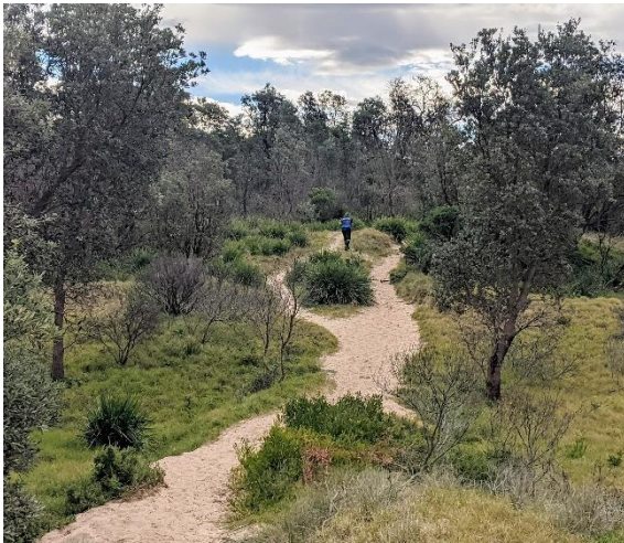
Broulee Dunes, sandy track