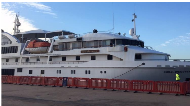
MV Coral Discoverer