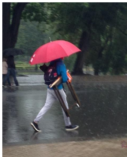
Control pickup, WMOC Sprint, Riga, Latvia