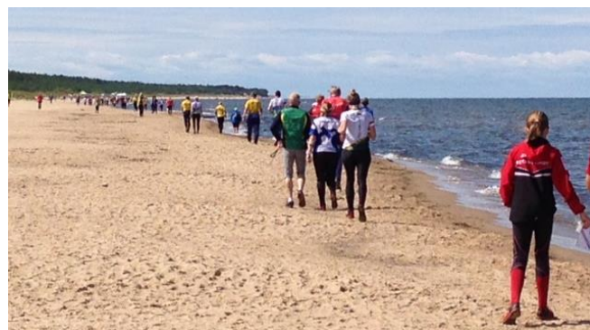
Walk to the start, WMOC Long, Latvia