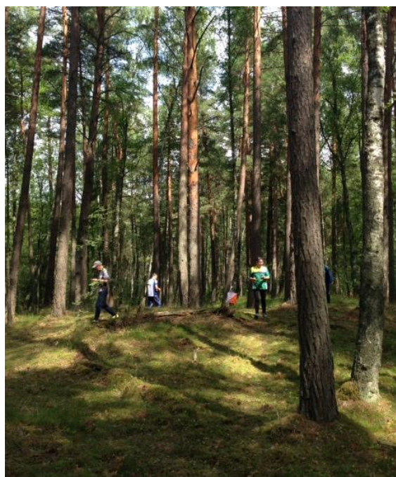
WMOC Forest Qualification Model Map, Latvia