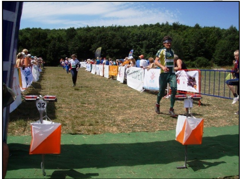
Not Kimbolton, but he finish chute at the World Masters in Hungary