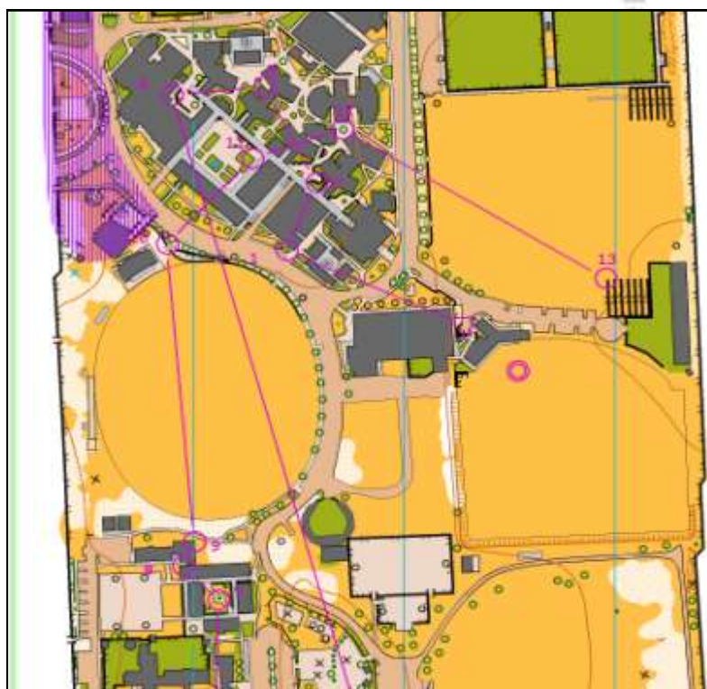
Part of course 3, Victorian Sprint Championships held at Haileybury College, in Keysborough, in Melbourne's southeast.